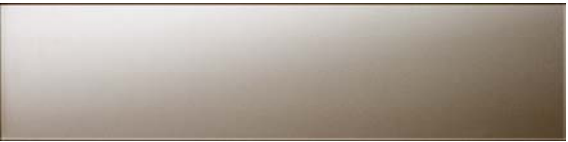
glossy Champagne metallic