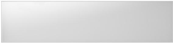
glossy white - grey